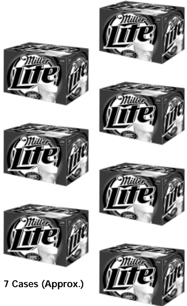
7 Cases (Approx.)